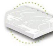
Wood pellet bags