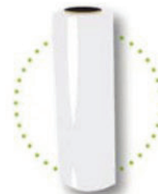
Pallet wrap & stretch film