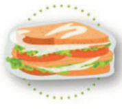
Ziploc & other reclosable food storage bags