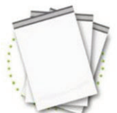
Plastic shipping envelopes