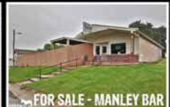
FOR SALE - MANLEY BAR