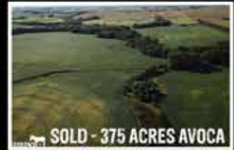
SOLD - 375 ACRES AVOCA