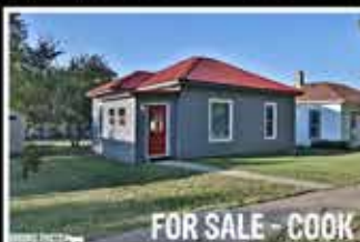
FOR SALE - COOK