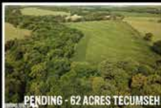
PENDING - 62 ACRES TECUMSEH