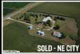
SOLD - NE CITY