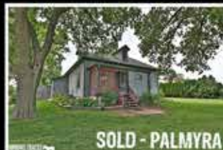
SOLD - PALMYRA