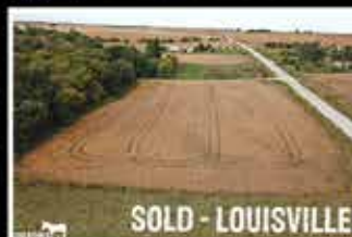
SOLD - LOUISVILLE