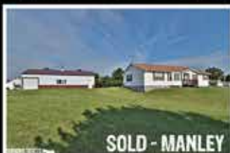
SOLD - MANLEY