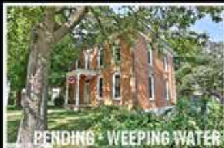
PENDING - WEEPING WATER

INVENTORY IS LOW & WE HAVE BUYERS WAITING NOW!