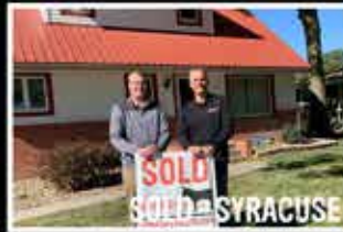
SOLD - SYRACUSE