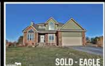
SOLD - EAGLE