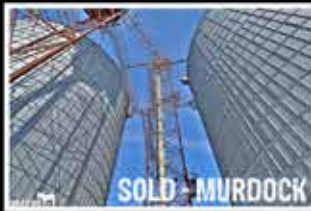
SOLD - MURDOCK